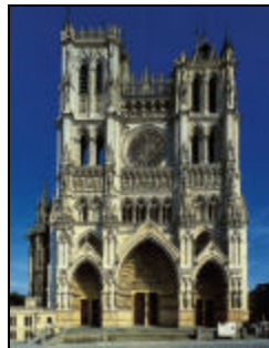
Notre-Dame cathedral at Amiens was completed in 1280 and the peak of the ceiling is 42m/138 ft high. Notre-Dame in Paris could fit inside it twice.

We visited Amiens to see the magnificent cathedral and I wanted to visit the site of ghastly WW1 Battle of the Somme where over a million died fighting for very little.