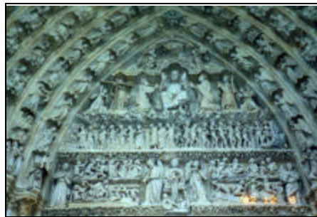
There are 4000 carved figures inside & outside.