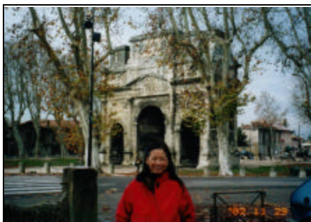
Triumphal Arch completed in 26 AD.

The Roman Theater in Orange seats 7000 and was built in the last decade BC. It is one of only 3 that retain the wall behind the stage, the others being in Turkey and Syria making them rather less accessible. Events are still held there.