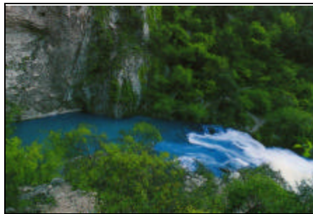
Fontaine de Vaucluse.

A short distance away is Vaucluse where a river surges out of the ground beneath a cliff and then tumbles down the hillside. My parents brought me here in 1983 and I was very keen for Lan to see it too since it is so unusual. It was well above normal flow when we saw it.