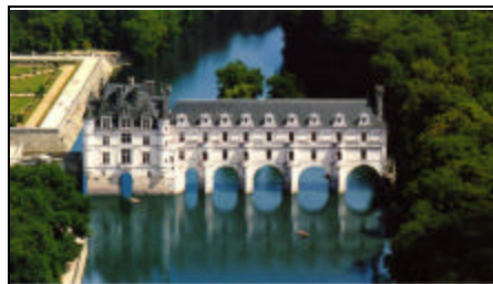
Chenonceau. During WW1, the owner converted it to a hospital at his own expense. During WW2, the chateau straddled the border between German-occupied territory and that controlled by the Vichy government so people and goods were smuggled through the building.

After visiting the famous chateaux of the Loire River valley around Tours and Blois in 1983, I could see why the French had a revolution. If I were a peasant toiling in the fields, I'd consider cutting off the heads of those who erected such vulgar displays of wealth. Nevertheless, they are nice to look at, none more so that Chenonceau .