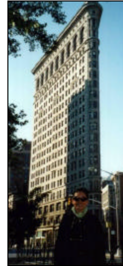
Completed in 1902, the elegant 21-storey Flatiron building is shaped like tall slice of cake. Like all tall buildings now, it has a steel frame. I've read that "the building created unusual eddies in the wind which would cause women's skirts to fly around as they walked on 23rd street. This attracted throngs of young men who gathered to view the barelegged spectacle." It was calm the day we visited.

so terribly that day but I left it until our last day only to find they are closed on Mondays. There was a caretaker at the Police Museum and we chatted briefly to him about his experiences.