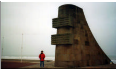
Memorial on Omaha Beach

1st US Infantry Division No mission too difficult. No sacrifice too great. Duty first. Forced Omaha Beach at dawn 6 June