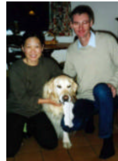
With Quinta , our favorite 4-legged friend at Jaap and Dorien's house. Note the security blanket.

I normally don't like domestic animals in general and dogs in particular but Quinta was indeed special.