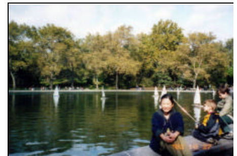
At the lake in Central Park.

We went looking for the spot where John Lennon was killed but couldn't find it. I knew that the Dakota Building was on 72 nd Street but incorrectly believed it was on the eastern side of Central Park.