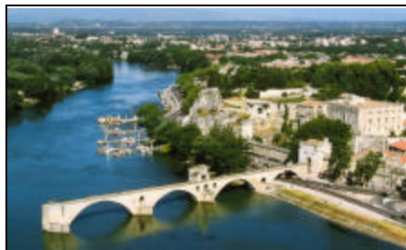
The bridge at Avignon and Palace of the Popes at right. The land to the left is merely an island.

Civil strife in what is now Italy during the 1300s forced the Pope to get out of Rome and take up residence in Avignon . A fortified palace was built to house him though there isn't much to see inside. The bridge was far more interesting. As the story goes, a shepherd entered church during mass claiming God had told him to build a bridge over the river. The crowd laughed but someone set a test for him saying that if God had sent him, he would be able to lift a huge stone. He did; the bridge was built. First of timber but then of stone, the bridge opened in 1185 but had to be repaired after every flood. The river finally won in 1669. There is also a nursery song about the bridge.