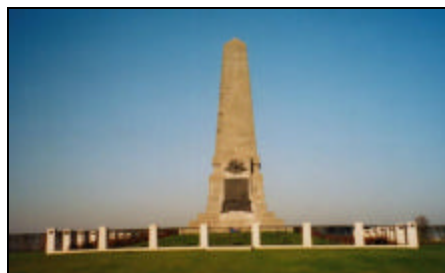
The Australian memorial at the Somme.

I've pondered how long we remember a war and concluded as long as survivors are still alive. The Napoleonic Wars changed Europe just as drastically, yet I feel no link with them. The very last survivors of WW1 are dying now and that chapter of history is closing. A hundred years from now, the trenches will be barely distinguishable, the evidence gone.