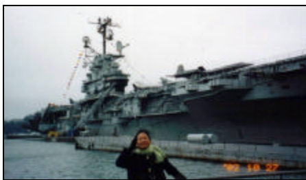
At the Intrepid floating museum. Lan appears to be saluting to match the military theme but she is just brushing her hair away from her face. Though not carrier-based, an SR-71 spy plane can be seen on the deck.

We did an excellent boat trip around the island (it is much longer than I imagined) and then looked over the aircraft carrier Intrepid which is docked as a permanent museum. Various aircraft are arranged on the flight deck and the hangar below is crammed with naval history.