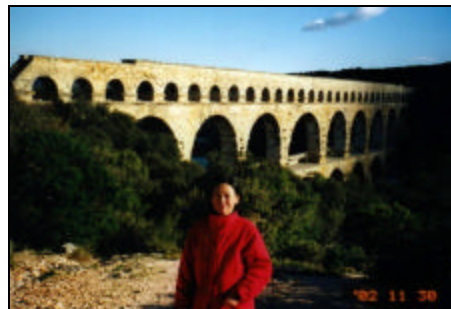
The aqueduct at Pont du Gard.

the flow. It is not nearly as long as the one Lan saw in Segovia, Spain but at 49m/160 ft it is taller.