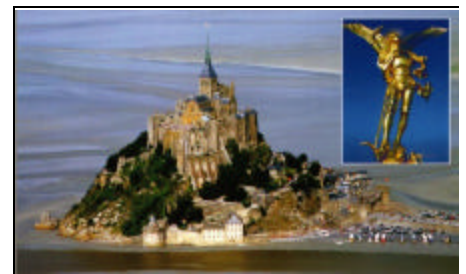
Mont St. Michel.

Mont St. Michel rises above the mudflats on a granite outcrop just offshore like a huge ship at sea. The first Christian building on the site was built in 708 and it gradually grew from there along with fortifications and a village at the bottom of the slopes. In fact, the statue of St Michael on top of the steeple is a mere century old. After the Revolution, it was used as a prison for a time. The car park is flooded during very high tides so a sign tells you in French, English and German how long you can stay.