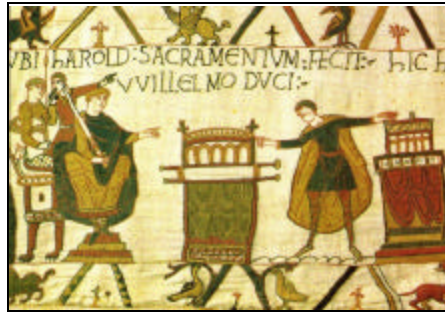
Bayeux Tapestry. Here, hapless Harold swears on the relics of saints that he will hand over the crown to William who bailed him out of trouble.

One of the highlights of the trip was the Bayeux Tapestry . I had seen it in 1983 but had no memory of it. It is essentially a 900-year-old cartoon telling the story of how William of Normandy became William the Conqueror at the Battle of Hastings in 1066. It is in stunning condition given its age.