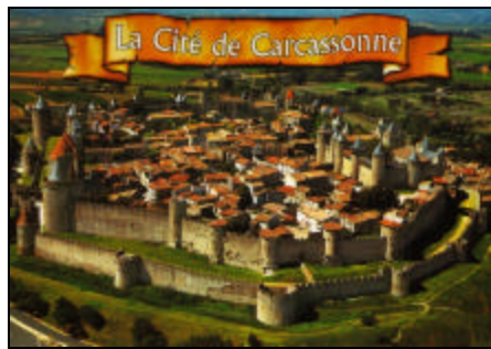
Walled city of Carcassonne.

Legend has it that during a long siege by Charlemagne in the 9th Century, the city was starving and close to surrender. The mayoress had an idea: a pig was fed with the last of the grain and catapulted over the wall. The animal burst on impact, scattering the grain. The attackers concluded that the city must still have plenty of food—so they gave up the siege and went home!