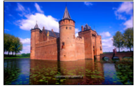
Muiden Castle

The tour included a room of armor and weapons from the Middle Ages. Two items were particularly interesting. One was suit of armor that weighed 70 kg/150 lbs. which would protect its wearer but severely limit his mobility. The other was stone balls, perhaps 40 cm/16" in diameter. I thought they were to be fired from a primitive cannon but they were to be rolled down steps as enemy soldiers climb up to attack.